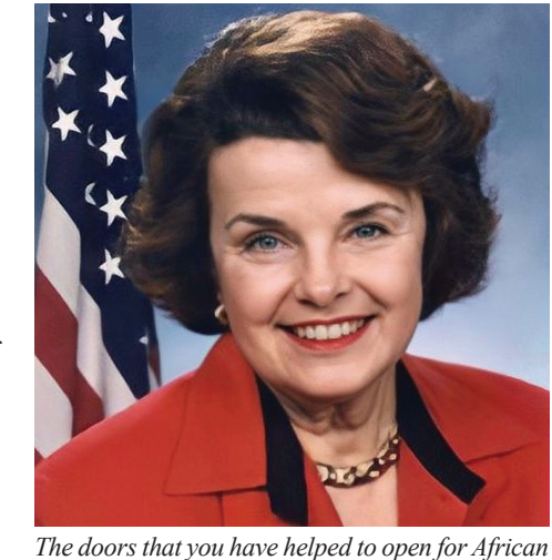
Americans in the contracting business has helped pave the way for future leaders to follow. Everyone has benefitted from your hard work

advocate for minority contractors in the public and private sector has been truly inspirational. Small Business Exchange • Voice of Small, Emerging, Diversity-Owned Businesses Since 1984